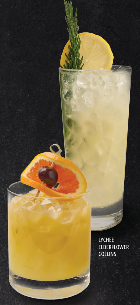
BD'S PASSIONFRUIT PUNCH

Tequila, triple sec, fresh lime, and citrus sour. Choose from our classic margarita, or strawberry. Frozen or on the rocks $6.00